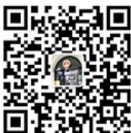
Chinese Embassy in UK WeChat

Question: Why does the nuclear submarine cooperation between the US, the UK and Australia seriously jeopardize peace and stability in the Asia-Pacific?