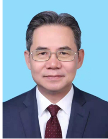
Message from Ambassador